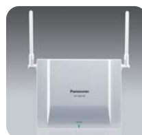
KX-TDA0156 4ch Cell Station