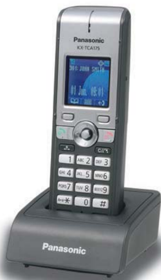
KX-TCA175 Standard Model