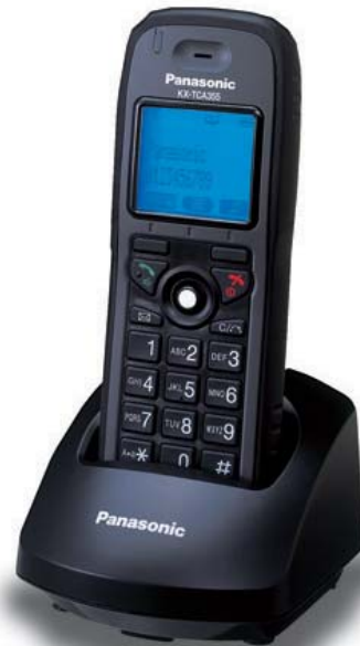
KX-TCA355 Tough Type Model