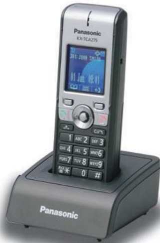
KX-TCA275 Compact Business Model