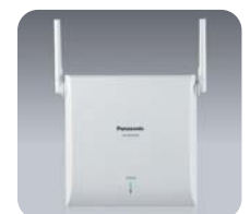
KX-NCP0158 8ch IP Cell Station