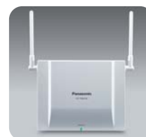
KX-TDA0158 8ch Cell Station